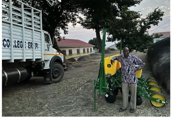
John Deer Planter (Individual donor provided)